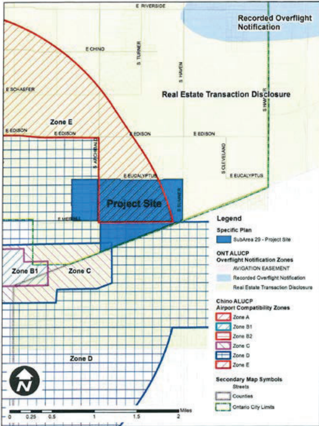
EXHIBIT 10—AIRPORT INFLUENCE AREAS