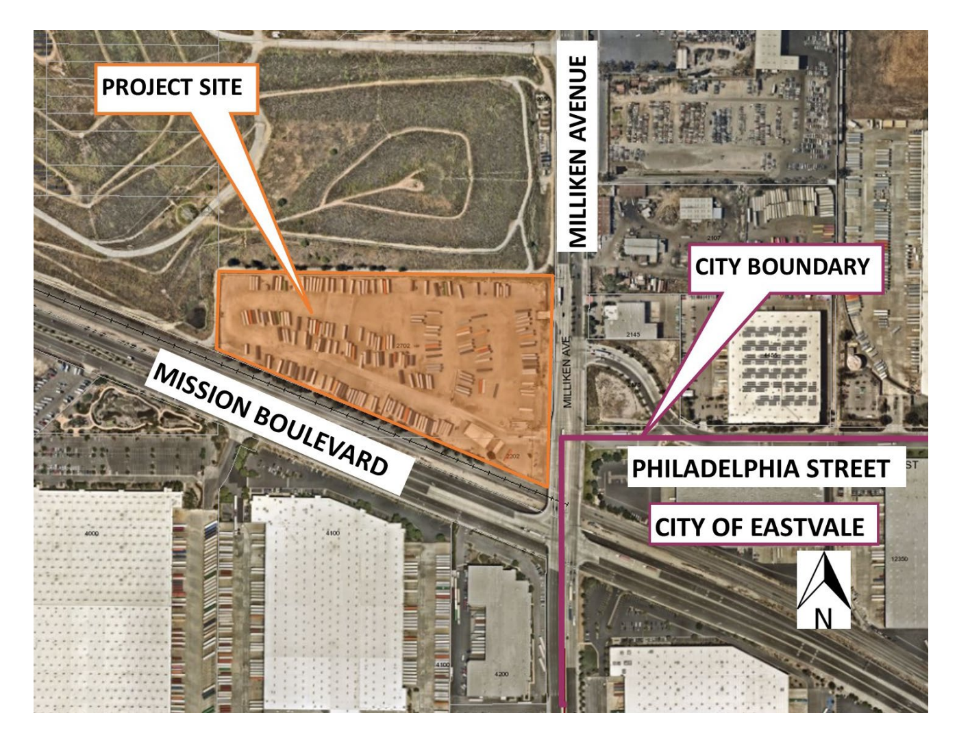
Exhibit A: PROJECT LOCATION MAP